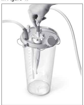
FIGURE 4. ATTACH VACUUM TUBE TO COLLECTION CANISTER

5. Non-sterile person attaches the tissue removal device vacuum tubing to the corresponding connection on the tissue trap of the collecton canister as shown in Figure 4.