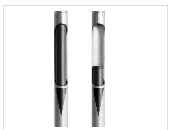
FIGURE 5. CLOSED TISSUE REMOVAL DEVICE CUTTING WINDOW ON LEFT

WARNING: Periodic irrigation of the tissue removal device tip is recommended to provide adequate cooling and to prevent accumulation of excised materials in the surgical site.