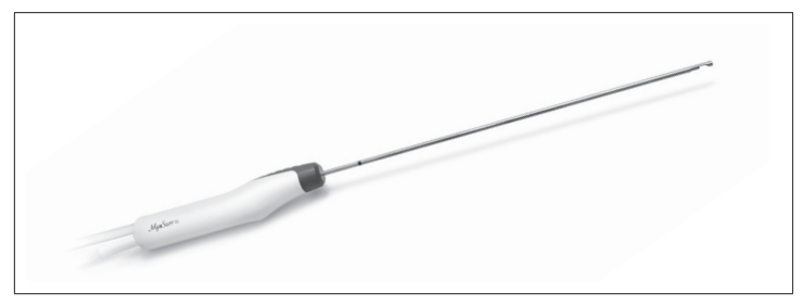
FIGURE 1. MYOSURE® XL TISSUE REMOVAL DEVICE

The MyoSure XL Tissue Removal Device is shown in Figure 1. It is a handheld unit which is connected to the control unit via a 6-foot (1.8-meter) flexible drive cable and to a collection canister via a 10-foot (3-meter) vacuum tube. Cutting action is activated by a foot pedal. The tissue removal device is a single-use device designed to hysteroscopically remove intrauterine tissue.