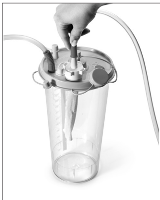
FIGURE 4. ATTACH VACUUM TUBE TO COLLECTION CANISTER