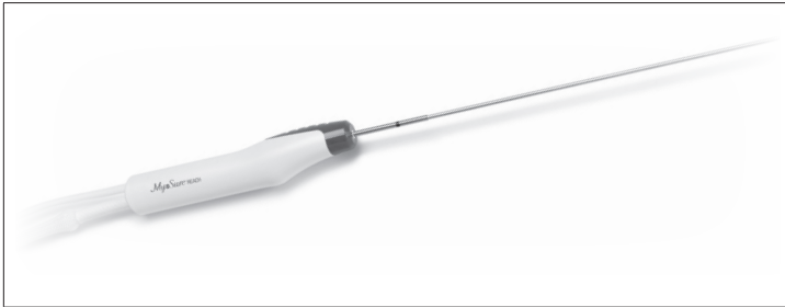
FIGURE 1. MYOSURE TISSUE REMOVAL DEVICE

The MyoSure Tissue Removal Device is shown in Figure 1. It is a hand-held unit which is connected to the control unit via a 6-foot (1.8-meter) flexible drive cable and to a collection canister via a 10-foot (3-meter) vacuum tube. Cutting action is activated by a foot pedal. The tissue removal device is a single-use device designed to hysteroscopically remove intrauterine tissue.