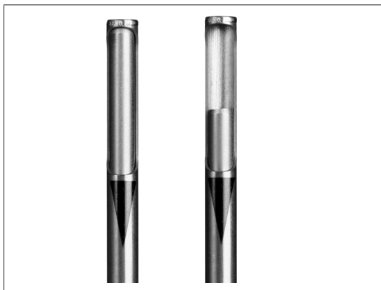
Figure 5. Closed Tissue Removal Device Cutting Window on Left

WARNING: Periodic irrigation of the tissue removal device tip is recommended to provide adequate cooling and to prevent accumulation of excised materials in the surgical site.