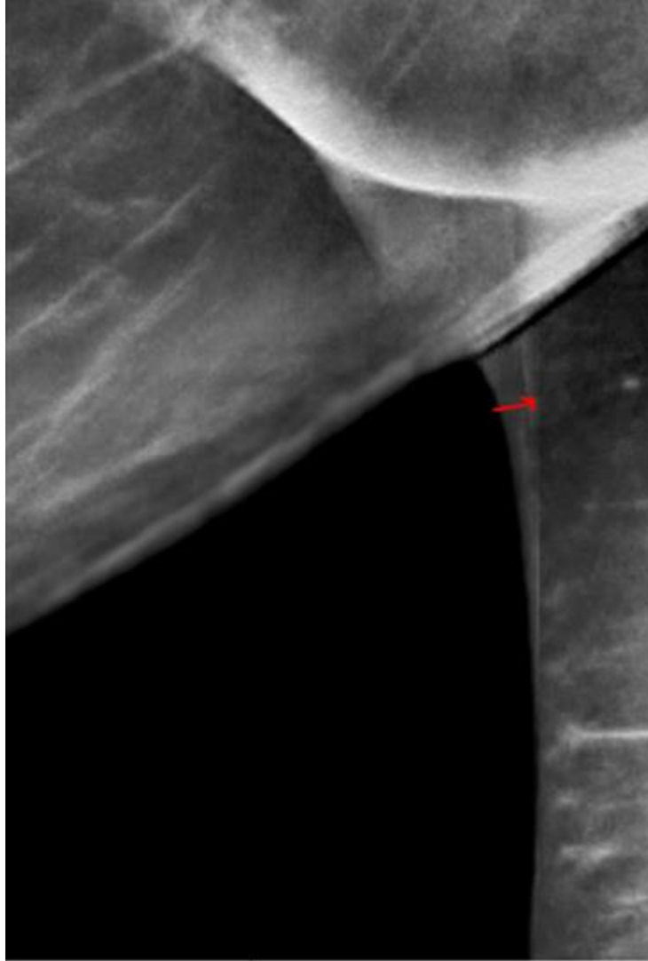
Figure 2 – Vertical Linear Feature Seen on C-View Image

The acquired DBT images are combined to generate the C-View image which may display a linear feature that appears vertically in the IMF or cleavage area as shown in Figure 2.