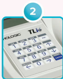
2 Enter the patient information