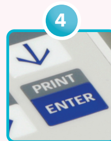
4 Press Enter and walk away.