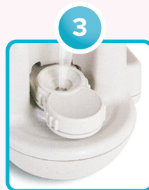
3 Dispense specimen into the Rapid fFN® Cassette well