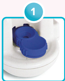
1 Run the TLI IQ ® QCette® once a day.

Total operator time is less than 60 seconds per test. 1