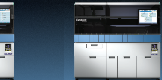
PANTHER® Real-Time TMA