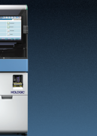
PANTHER® Real-Time TMA