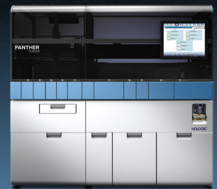
PANTHER FUSION® Real-Time PCR