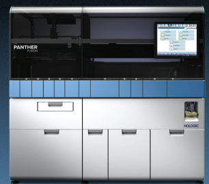
PANTHER FUSION® Real-Time PCR