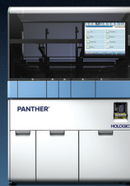
PANTHER® End-Point TMA

Panther® Scalable Solutions allows you to expand your testing menu while adding on flexibility, capacity and walkaway time.