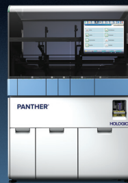
PANTHER® End-Point TMA

The perfect combination. Superior automation meets premium assay performance.