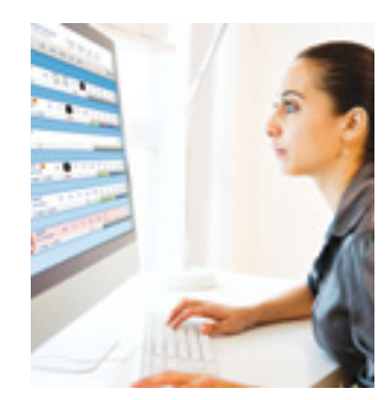
Monitor instrument information and results from an office computer.

Access instrument status and messages from an iPad.