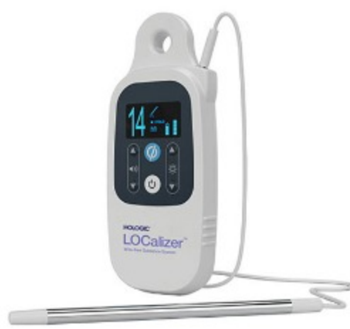
LOCALIZER™ Wire-free Guidance System