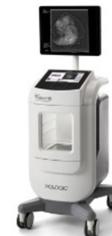
Faxitron® Trident® HD Specimen Radiography System