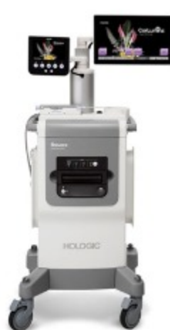
Brevera® Breast Biopsy System