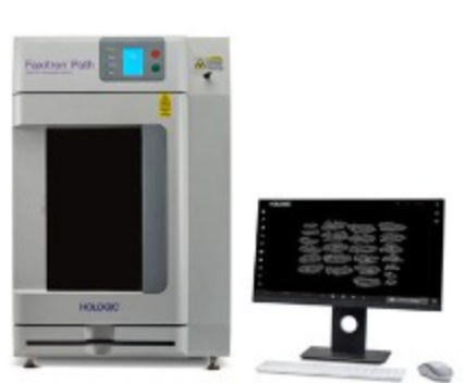
Faxitron® Path Specimen Radiography System